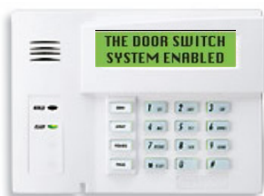
Example of Basic Monitoring Keypad Console

All system components are electronically supervised and will notify if maintenance is required. Monitored doors can be isolated from the system during maintenance.